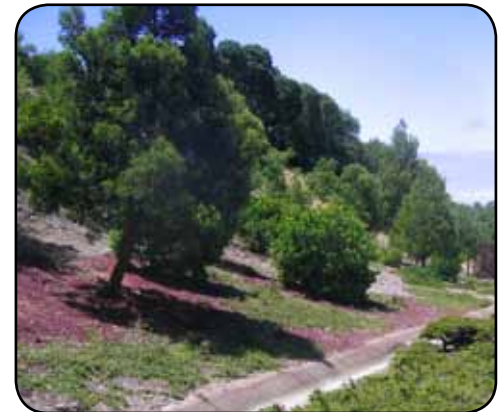
Well managed landscapes can save you water and money.